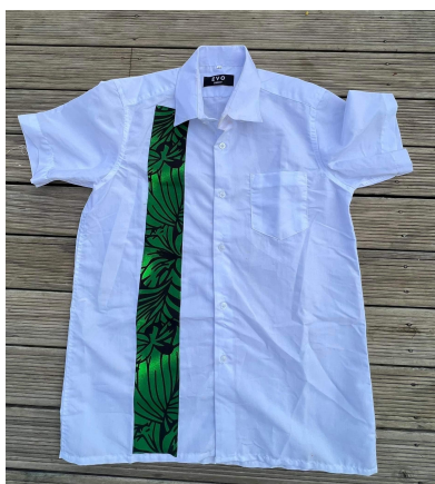
Dress Shirt = $10