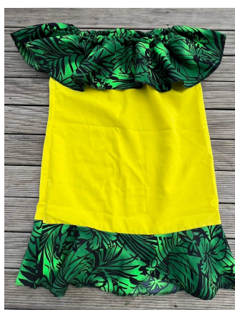
Girls Dress = $10