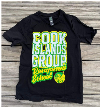
Prices: T-shirt = $15

As of next Monday, Te Uki ou o Rongomai are selling some of their old uniform stock. The uniforms have been worn 2-3 times and are all clean. If you are interested in purchasing an item, you can do so from the school office between 8.30am - 2.30pm. First in, first served.